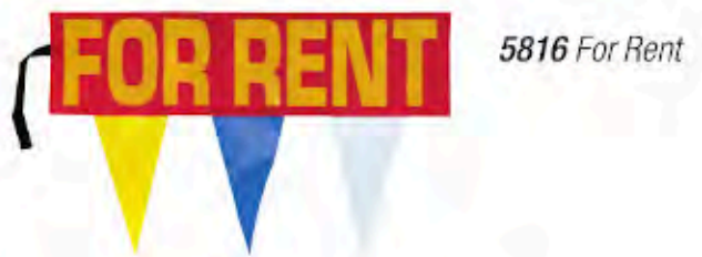
5816 For Rent