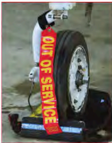
5811 Out of Service

Protect your investment with our Duty Safety Streamers. These feature Heavy-Duty nylon straps with brass gromets and genuine Velcro® for a secure attachment.