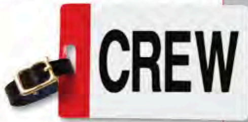
6001 Crew Luggage Tag

Don't let your luggage get mixed with your passengers'. Degroff Aviation CREW LUGGAGE TAGS are printed with high visibility on both sides and have genuine leather straps for quality and durability.