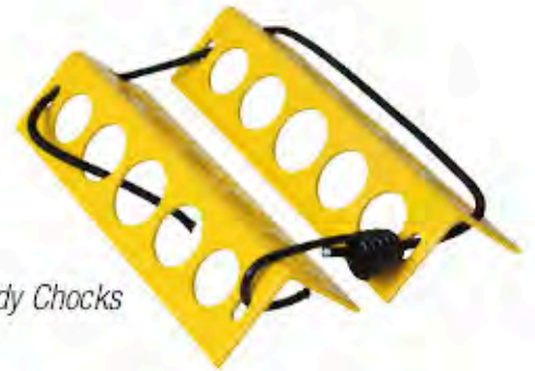
5904-Y Handy Chocks

Our Handy Chocks work perfectly for CIRRUS and other aircraft with full wheel pants. Avoid damage to your shiny wheel pants from large chocks that are found on many ramps. Fabricated with lightweight aluminum, each package of two includes a bungee cord and vinyl covered hook so you never leave one behind. Powder coated in red or yellow.