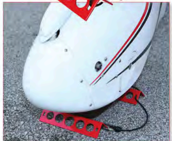
4610 WickShield Static Wick Safety Flag