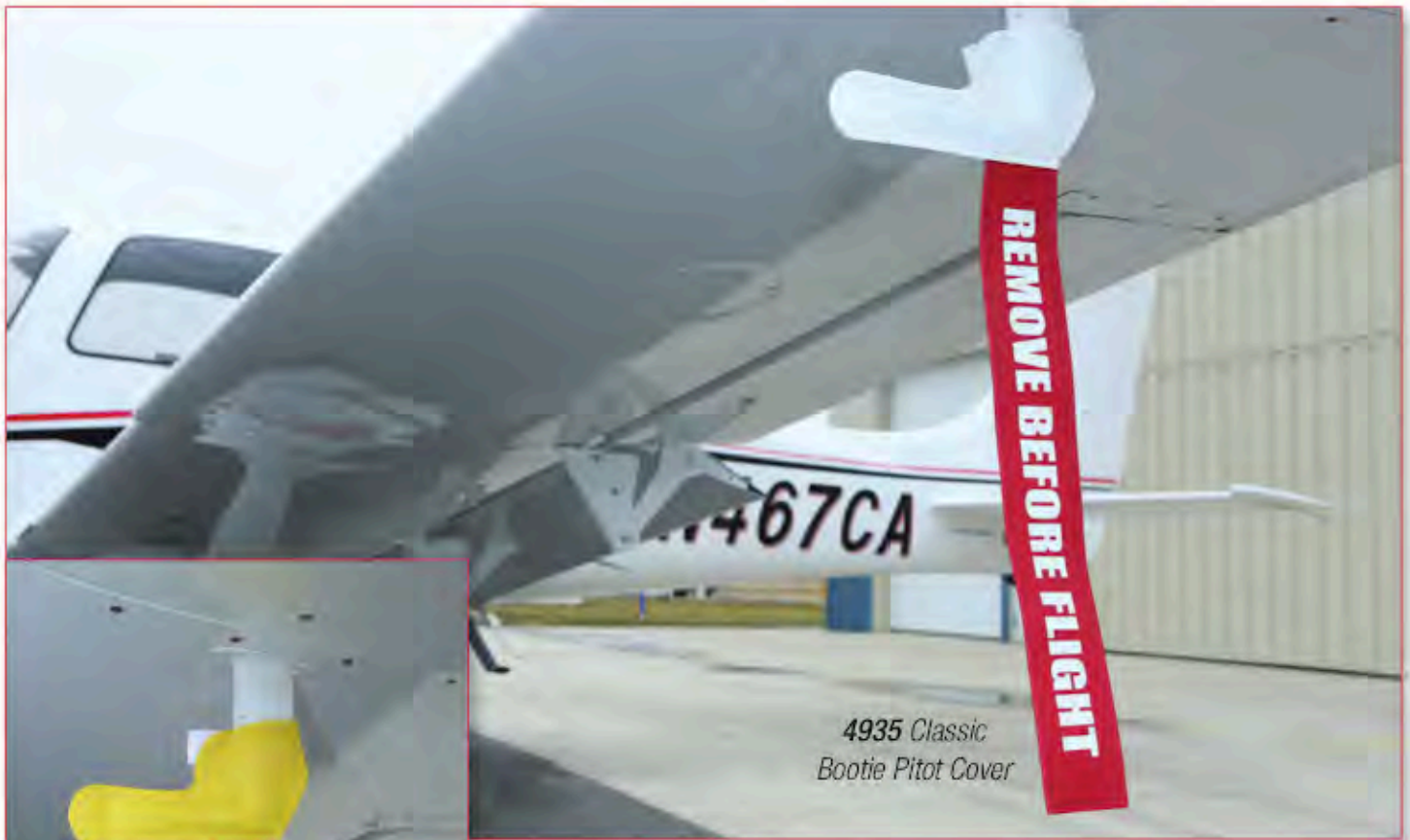
4935 Classic Bootie Pitot Cover