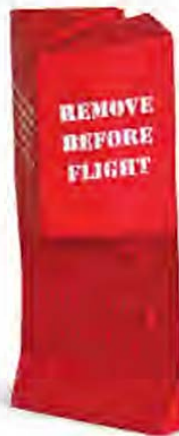
7501 Blade Type