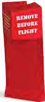
7502 5/8" Tube