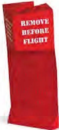
7500 9/16" - 3/4" Tube