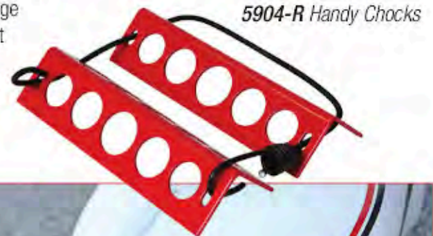
5904-R Handy Chocks