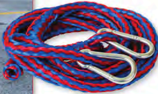
5901 EZ Lock Tie Downs

Allows for simple, one-person tie-down of aircraft, with no knots to tie. Perfect for simple, locking tie-down of your aircraft. Features weather-resistant, oil-resistant and gas-resistant polypropylene rope for long product life.