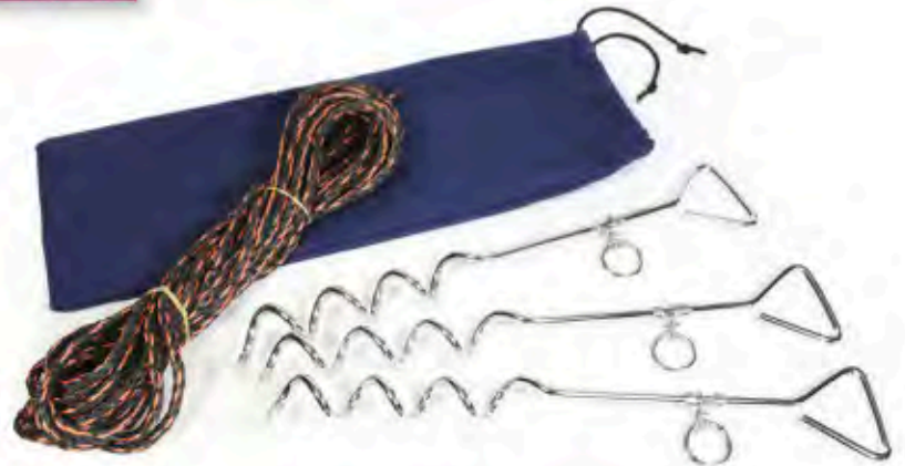
5096 Portable Anchor Kit

Portable kit comes with carrying bag; three 17" x 3/8" plated steel corkscrew stakes, and three 10' x 3/8" black and orange polypropylene ropes.