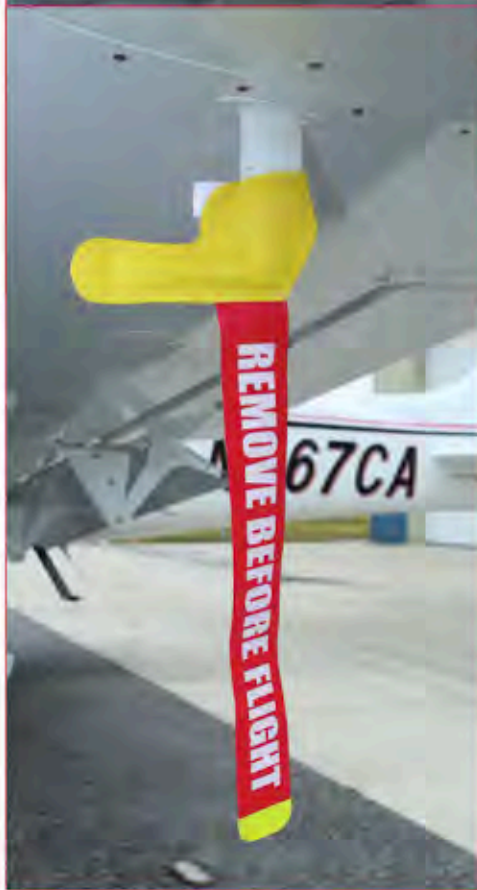
4935E High Visibility Bootie Pitot Cover