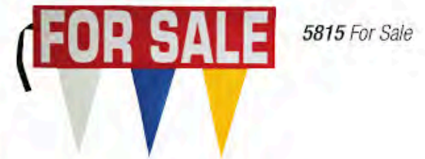
5815 For Sale