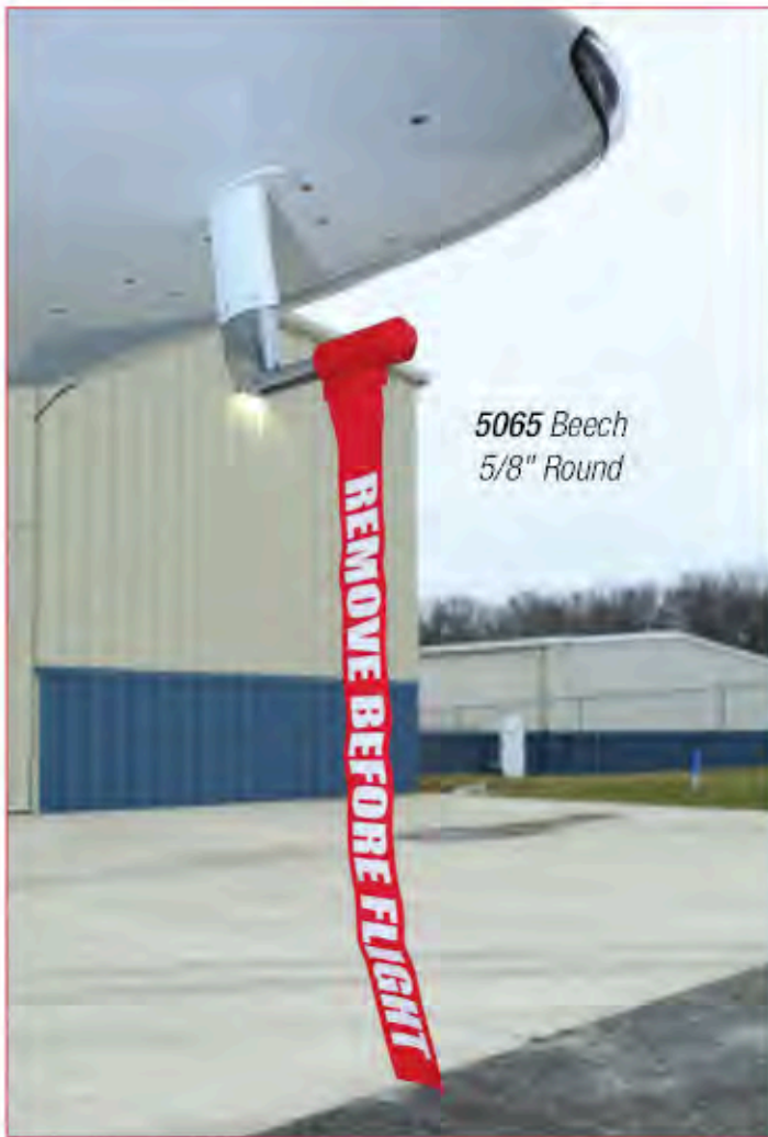
5065 Beech 5/8" Round