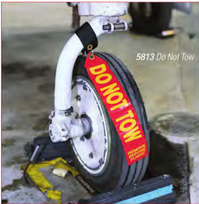
5813 Do Not Tow